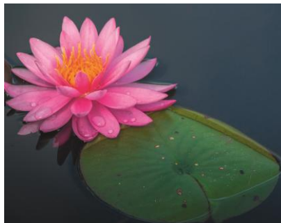
Use other colour control method