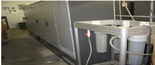
System tucked behind new Heidelberg 8 color sheet press