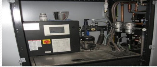
Hoses going into solution tank