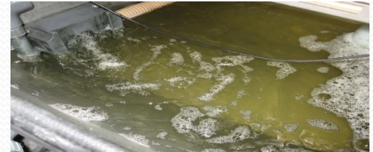
Solution remains clear as new with no change in pH or conductivity.