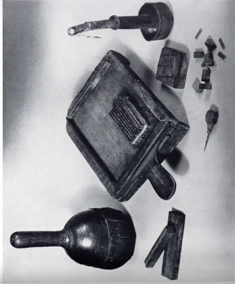
Nos. 103 ff. Printer's equipment of the early nineteenth century: a ball, galley and slice, candlestick, and sundries