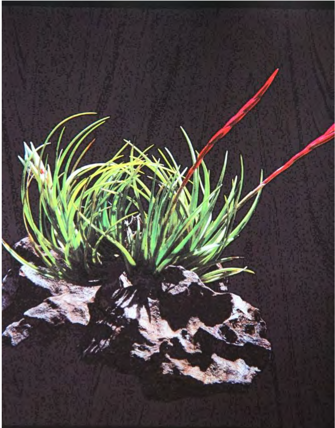
Tillandsia dura. This attractive little plant has stiff green recurved leaves. It always grows into small clusters. When blooming, it produces a simple red spike with violet flowers.