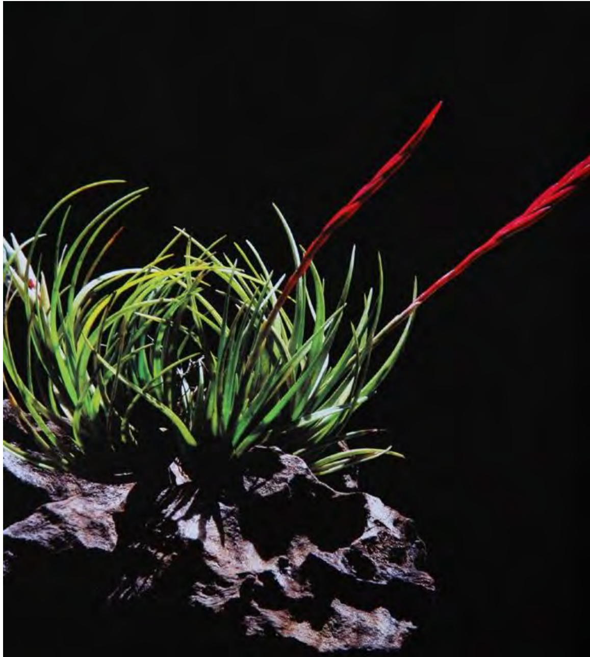
Tillandsia dura. This attractive little plant has stiff green recurved leaves. It always grows into small clusters. When blooming, it produces a simple red spike with violet flowers.